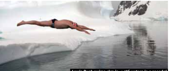
Lewis Pugh swims 1km in -1.7°C waters in a speedo!

21 Yaks and a Speedo: How to Achieve Your Impossible is a mustread.